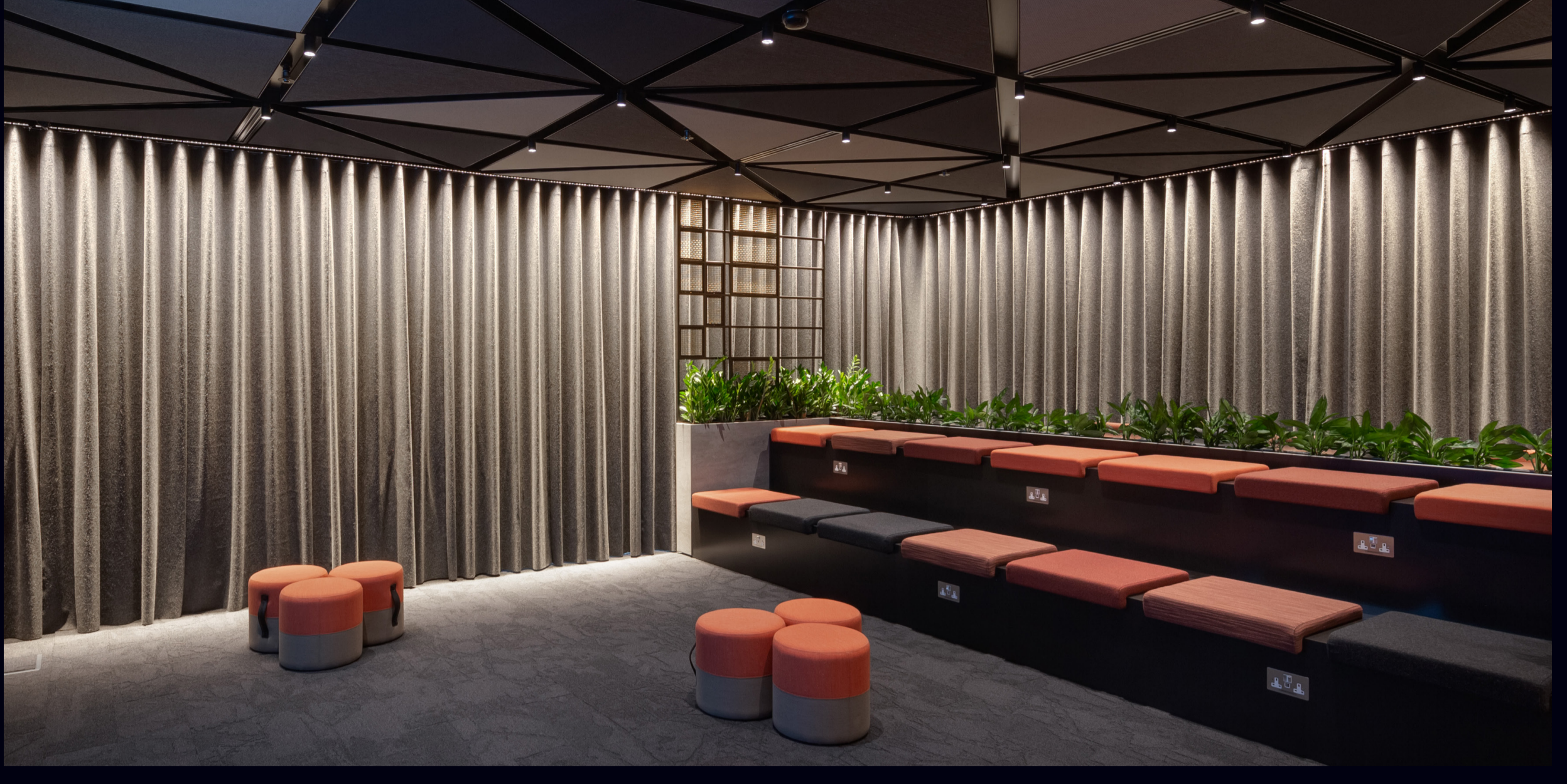
Freshfields Bruckhaus Deringer, 100 Bishopsgate, London Lighting design by 18 Degrees