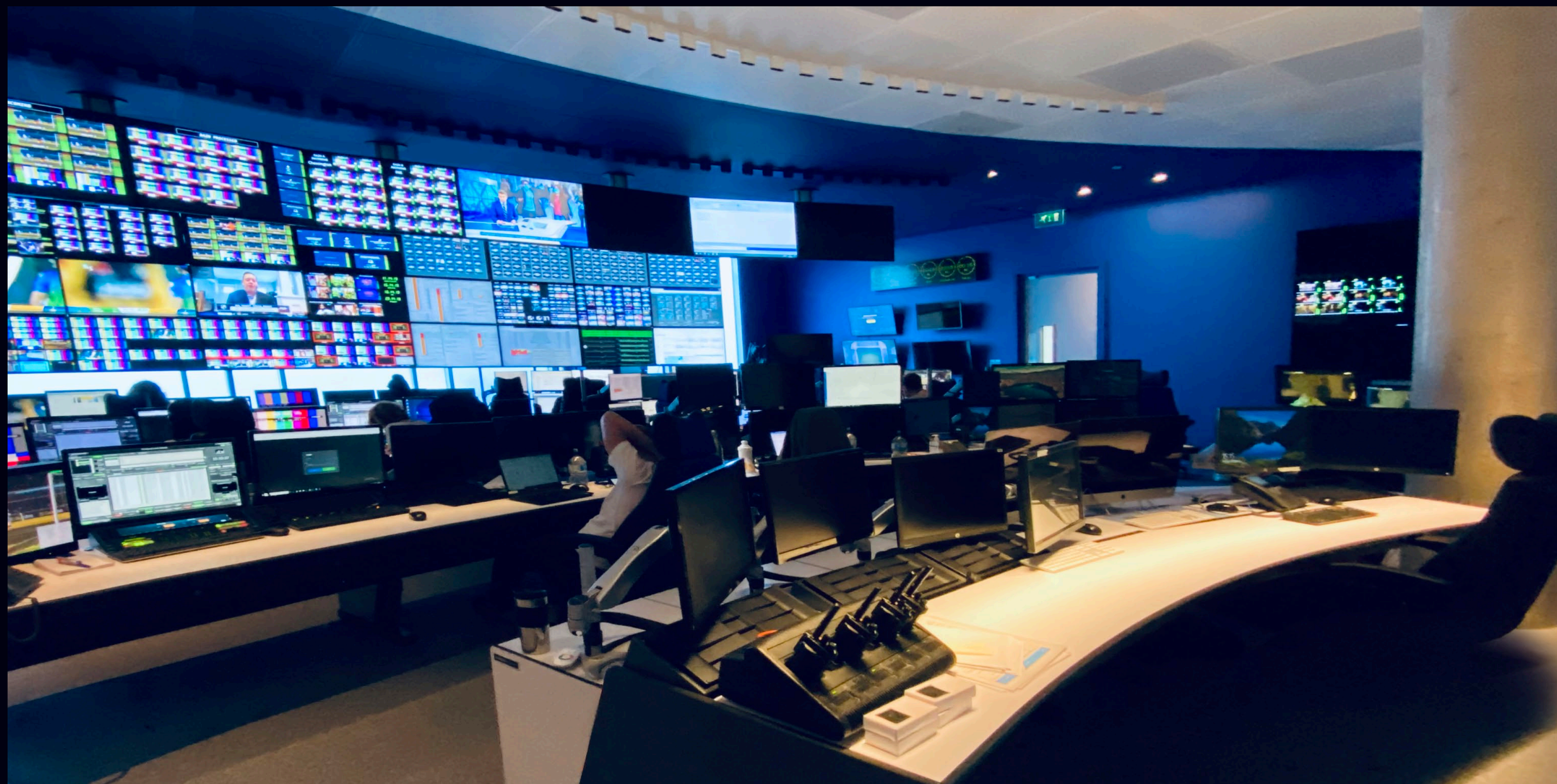
Encompass Control Room, London