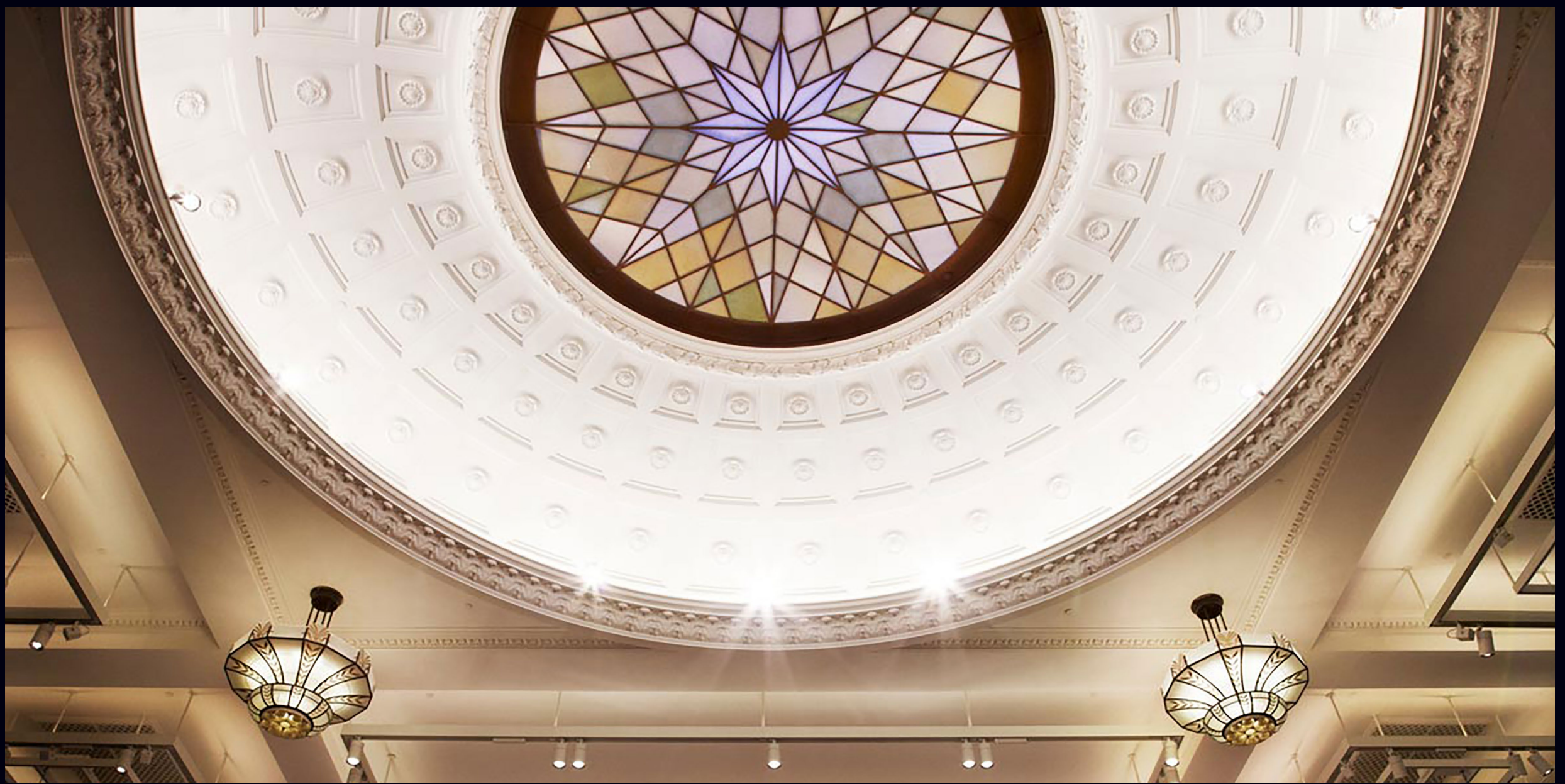
Burberry flagship store, Regent's Street, London Lighting design Office of Light

The Radiant 3D LED Flex 100 system was used to up-light the domes in the Burberry flagship store in Regent Street with lighting design by Russell Lipscombe from Office of Light. The patented mechanical joint structure allows the individual modules to be bent and twisted in three dimensions to follow domes and other non-linear building contours. Each 100 mm module comprises of 4 x high power LEDs with elliptical beam lenses - creating a highly-controlled light graze effect, illuminating the dome with an even distribution of light. Each LED heat sink module can operate up to 10 Watts of LEDs giving a light output of over 9,500 lumens per mtr.